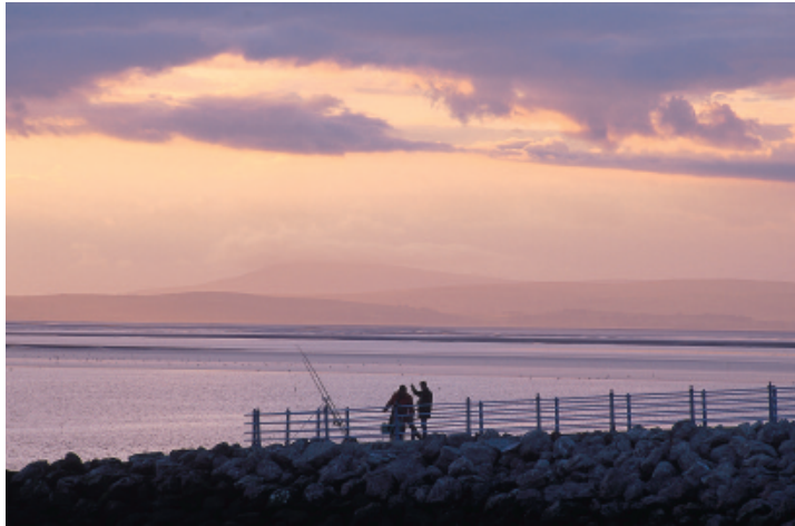
Anglers, Stone Jetty, Morecambe

In earlier times, Morecambe Bay shrimps and other produce were loaded onto trains on the Stone Jetty for express despatch to London and other cities.