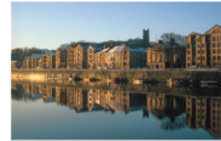
St George's Quay, Lancaster The eighteenth century waterfront remains largely intact, though the former warehouses have been converted to residential use.