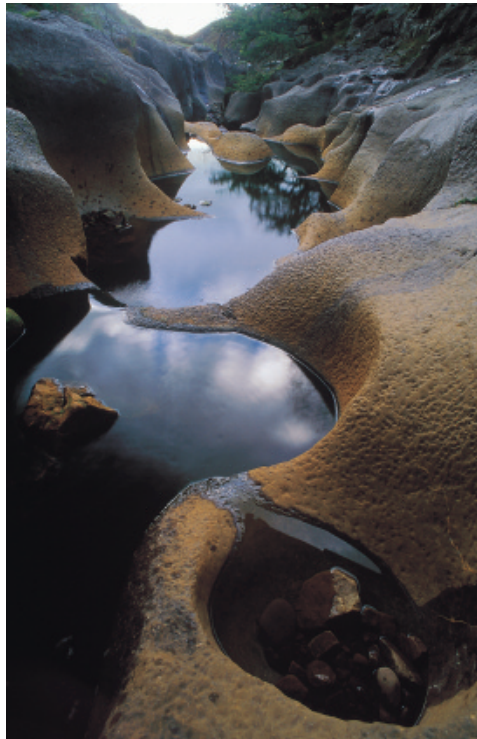
Leck Beck This is the very edge of Lancashire – the boundary follows the beck – and the most northerly location in the book.

In earlier times, Morecambe Bay shrimps and other produce were loaded onto trains on the Stone Jetty for express despatch to London and other cities.