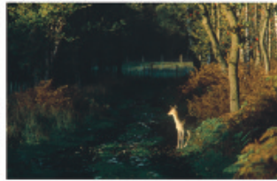
Follow deer, Throng Moss

Opposite page: Littleole and Ward's Stone from Baines Crag Baines Crag is only a few kilometres from Lancaster on the edge of the Forest of Bowland AONB. On the skyline is Ward's Stone, the highest point in the Bowland Fells.